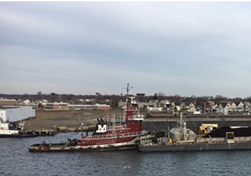
Coal transferred via crane from one barge to another.