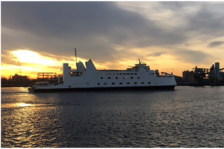
One of three ferries owned and operated by the Bridgeport and Port Jefferson Steamboat Company whose terminal is located on the west side of the harbor, and is moving forward with plans to develop a new terminal on the east side at Barnum Landing.